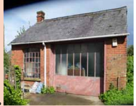
▲ Chapel Street

There are unsubstantiated reports that during WWII the Fire Station was moved to Sun Street, but it is believed that Fire Engines often were parked outside the ARP Post there. Can you