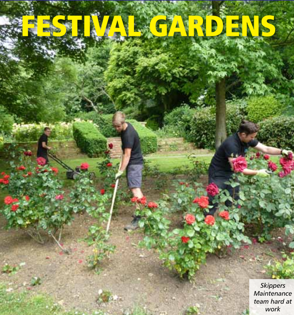
Skippers Maintenance team hard at work

Over the past two years we have invested time, effort and resource in improving this oasis of beauty and serenity in Crown Road.