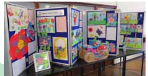
Childrens Artwork entered in Best Floral Representation

Billericay Town Council wishes to thank everyone involved, especially the local businesses that kindly sponsor the categories and the people of Billericay for entering their gardens and showing off their horticultural talents!