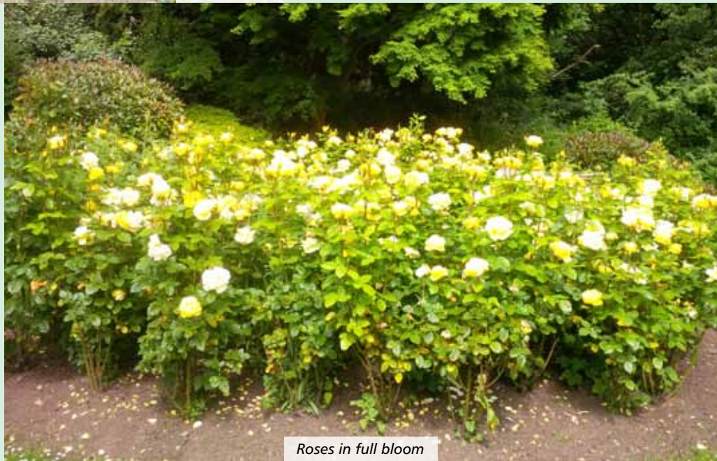
Roses in full bloom

Email: townclerk@billericaytowncouncil.gov.uk Telephone: 01277 625732