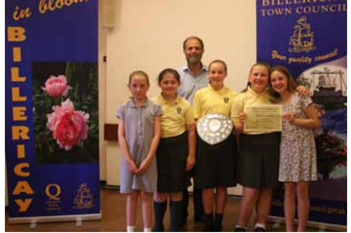
Quilters School – Winners of Best School Garden

Throughout the evening a slide show played showing photographs of the entries received. This was welcomed by those present who could not only see their own gardens but also the high standard of competitor's entries. It was also encouraging to have the enthusiastic response from the schools