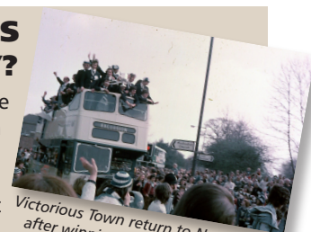
Victorious Town return to New Lodge after winning the FA vase in 1976 – they won this trophy three times.

Come on-dig out those photos, everything is useful from very recent to the mists of time.