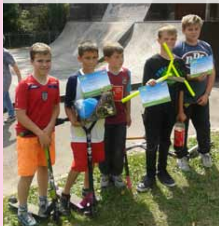
Winners of the 2014 Urban Games Skate Competition