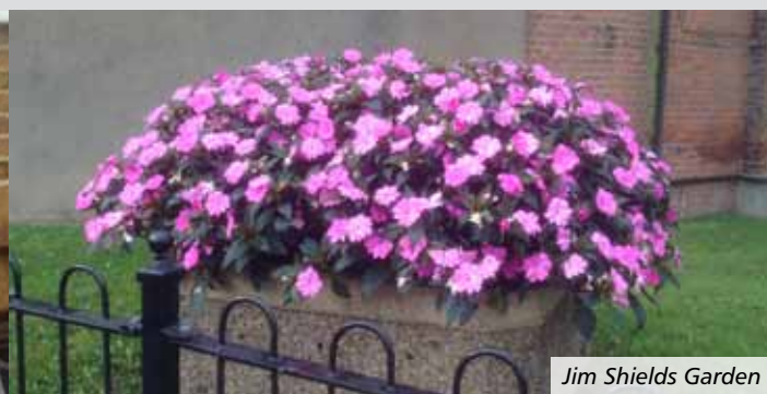
Jim Shields Garden