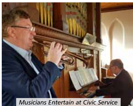
Musicians Entertain at Civic Service