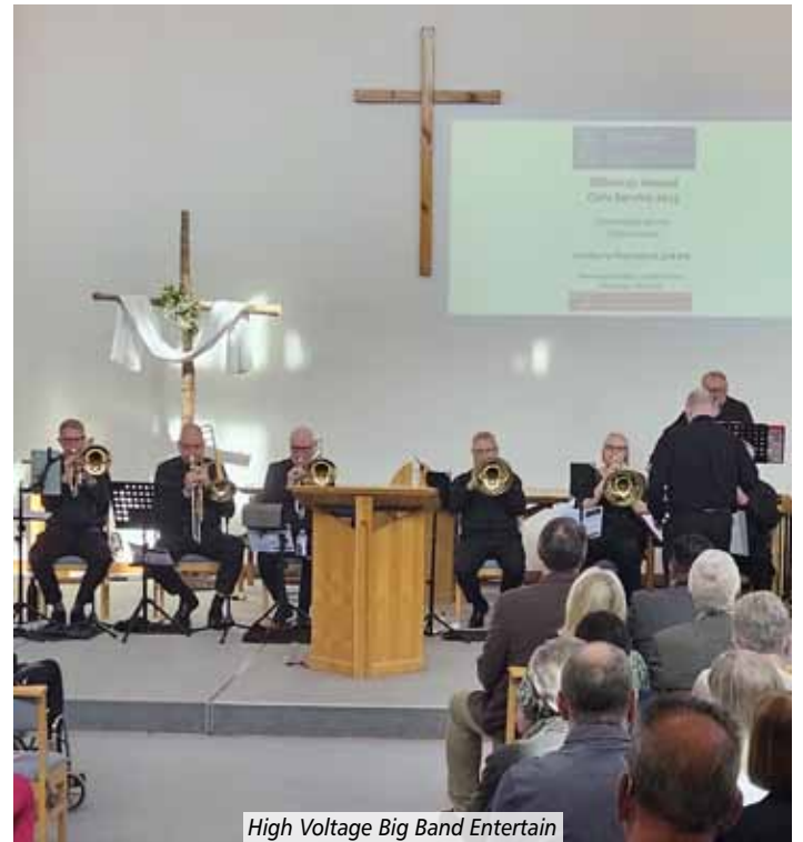
High Voltage Big Band Entertain