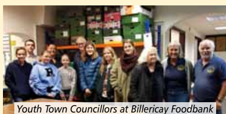
Youth Town Councillors at Billericay Foodbank

Here at the Youth Town Council, we have done our part in our community over the last year as a group dedicated to our community. We have visited our local food bank in which we organised food and received a talk from the kind volunteers who offer their time there. We have had discussions with Basildon Creative People and Places about arranging events in Billericay dedicated to our youth and creative interests. We are currently also working toward a Youth Café for those who need an area to either relax or study in after school. The council has worked incredibly hard this year in playing a part in improving the livelihood of not just the youth but everyone in Billericay. ■