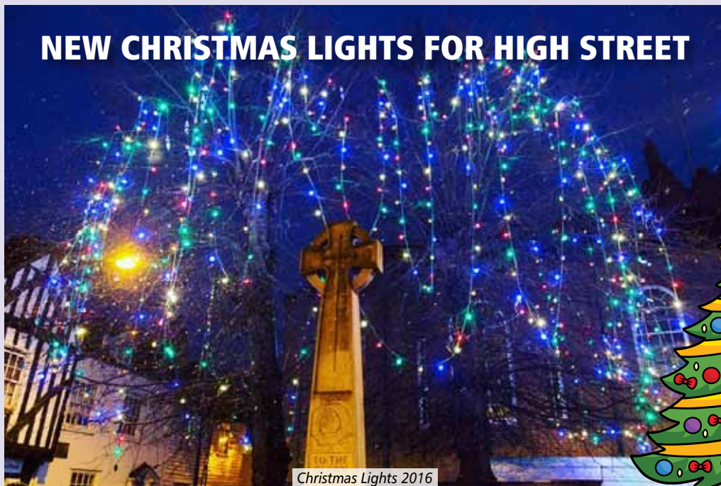
Christmas Lights 2016

MOST RESIDENTS WILL be aware that in the Spring Basildon Borough Council replaced the old High Street lamp columns with extremely smart heritage style lights. This coincided with the renewal of the Christmas Lights contract, so the Town Council was determined to provide an exciting new scheme, and now that there are brand new columns try to ensure that we get as much of the High Street illuminated as possible as