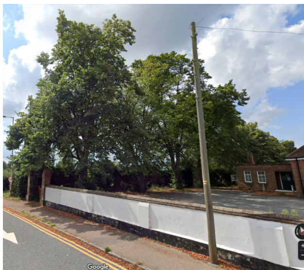
The 6 Lime trees adding to the “Street Scene” amenity along the Laindon Road

The 6 mature Lime trees at The Fold possibly represent a border between two farms or estates many years ago and form part of our local tree heritage. The trees also serve a quality “Street Scene” amenity aspect and are in their prime by absorbing air pollution in exchange for exuding oxygen that adds to the “Green Lung” effect, reducing respiratory problems that our town’s trees provide.