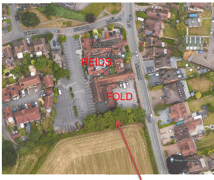
Plan view of The Fold and its 6 Lime trees