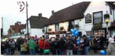
Christmas Lights Switch-on