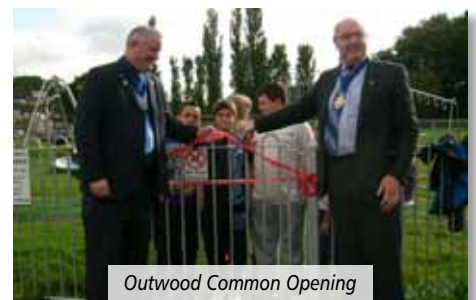
Outwood Common Opening

Play Area at Outwood Common – The Town Council engaged in a lengthy and productive consultation with all interested groups in Outwood Common and it was agreed that we work together to install a new play area for children up to eleven years old, plus new goal posts and a youth shelter for the older ones on the village green. At every stage we had open discussions with the local representatives and the results were truly impressive. We also reached agreement with Waltham Forest Borough Council who owned the land for a long lease and with Basildon Borough Council to keep the area free of litter. The generosity of the grant funders allowed the project to go ahead and to be a great success. We are all proud of the results and delighted to see that the children once again have an area in which to play and have fun. Partnerships really work.