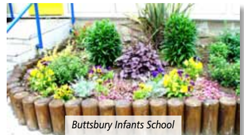
Buttsbury Infants School