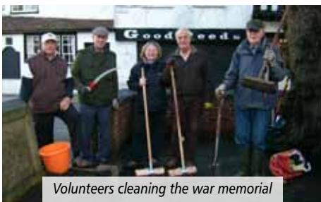
Volunteers cleaning the war memorial

The job of the Environment Committee is to assist in the enhancement of Billericay's environment. We do this either by providing additional services, or enhancing existing services provided by Basildon Borough Council or Essex County Council. Amongst other things we provide the Christmas lights for the High Street and additional 'litter picks' in areas that need an extra clean up. We also organize the hanging baskets in the High Street during the summer, and hold the Billericay In Bloom competition every year – this year was the 16th year of this most popular event.