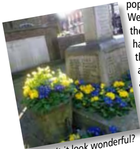
Doesn't it look wonderful?