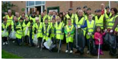
Litter Pick Volunteers

During the last year we have held three successful litter picks in the Billericay area including a first ever one at Queens Park and also at Outwood Common