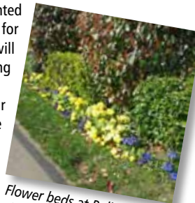
Flower beds at Police Station also maintained by the Town Council