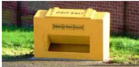
Kelvedon Road salt bin

These six new bins supplement those already provided by Essex County Council; the Town Council now can consider some additional bins at other sites, nominated by residents, where there are problems in icy or snowy conditions.