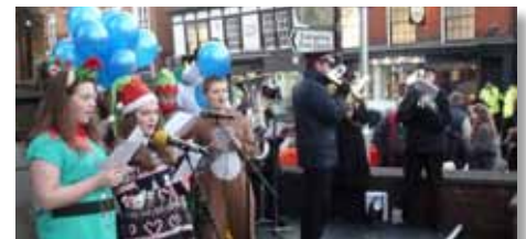
Youth Council Choir at Christmas Lights

We are very grateful to those organisations and individuals who have continued to sponsor this long standing competition. New sponsors for the competition are always welcome. The changes made in this competition have definitely improved it and we look forward to an even better competition this year.