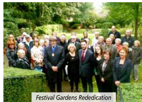
Festival Gardens Rededication

During the coming year the Recreation Working Party will be looking at further enhancements to Festival Gardens to improve it for our resident's use.