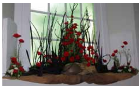
Windowsill in Mary Magdalen

The Church was filled with a profusion of wonderful floral displays in red and white, by the ladies from