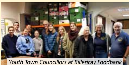
Youth Town Councillors at Billericay Foodbank

Here at the Youth Town Council, we have done our part in our community over the last year as a group dedicated to our community. We have visited our local food bank in which we organised food and received a talk from the kind volunteers who offer their time there. We have had discussions with Basildon Creative People and Places about arranging events in Billericay dedicated to our youth and creative interests. We are currently also working toward a Youth Café for those who need an area to either relax or study in after school. The council has worked incredibly hard this year in playing a part in improving the livelihood of not just the youth but everyone in Billericay. ■