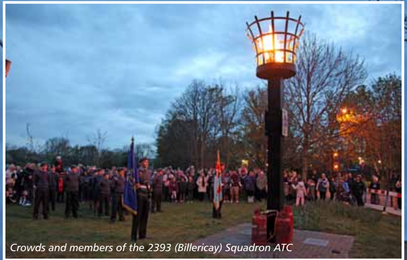
Crowds and members of the 2393 (Billericay) Squadron ATC