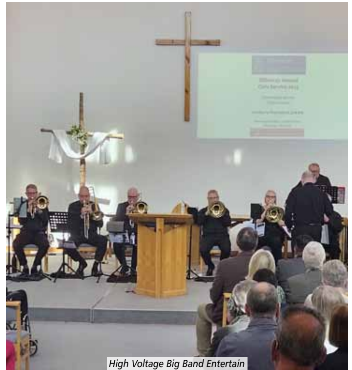
High Voltage Big Band Entertainment