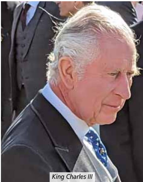
King Charles III