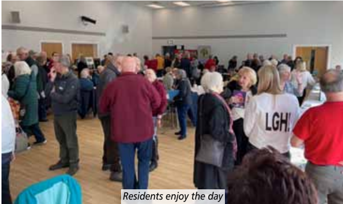
Residents enjoy the day