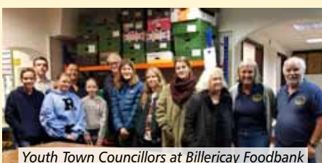
Youth Town Councillors at Billericay Foodbank

Here at the Youth Town Council, we have done our part in our community over the last year as a group dedicated to our community. We have visited our local food bank in which we organised food and received a talk from the kind volunteers who offer their time there. We have had discussions with Basildon Creative People and Places about arranging events in Billericay dedicated to our youth and creative interests. We are currently also working toward a Youth Café for those who need an area to either relax or study in after school. The council has worked incredibly hard this year in playing a part in improving the livelihood of not just the youth but everyone in Billericay. ■