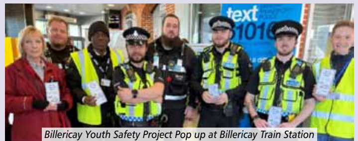
Billericay Youth Safety Project Pop up at Billericay Train Station

For more information on upcoming events please see our Instagram @ billericayyouthsafetyproject