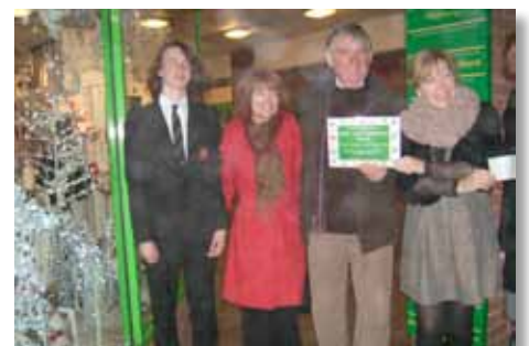
Presentation of the cheque at the Olive Branch

New Bench installed in The Festival Gardens