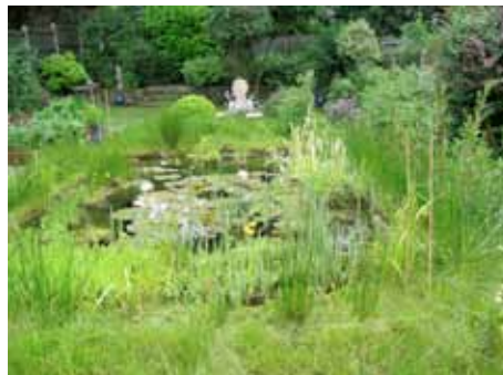
Billericay in Bloom – Best Wildlife Garden

Despite the adverse weather conditions the 15th Anniversary of the Billericay in Bloom competition was a great success with 72 entries. As always the judges were very impressed with the high standard of entries ranging from Best Garden in a container, for those at Junior School, right through to Best Sheltered Accommodation garden. Two new categories were included – Best Wildlife Garden and Best Domestic Greenhouse. The prizegiving event held in the Emmanuel Archer Hall was well attended