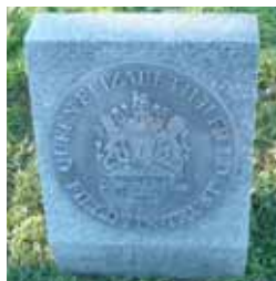
Queen Elizabeth II Field plaque

A dedication ceremony took place in November 2012 to celebrate Sun Corner being granted Queen Elizabeth II status. The status follows a joint campaign by the Town Council, Basildon Borough Council and Essex County Council. The