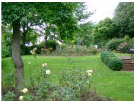
The Festival Gardens

The Town Council has taken over The Festival Gardens from Basildon Borough Council and has set about renovating the whole area and we have received compliments from the public on how it now looks – we still have a lot to do.