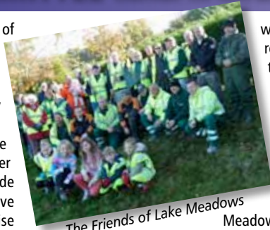
The Friends of Lake Meadows

In Lake Meadows we continue to have a very good relationship with the Borough Council and together we have made improvements, especially