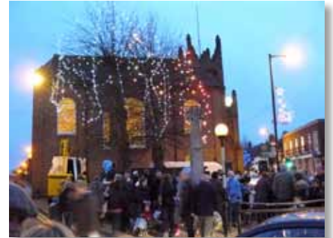
Crowds gather for the Celebration of Christmas Lights

The Town Council continued for the 8th year to organise and provide Christmas Lights for the High Street through the Christmas Lights Working Party.